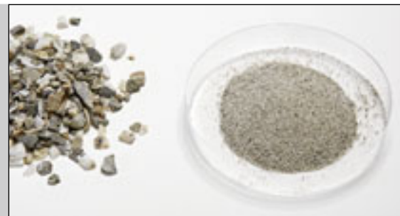
Stones before and after grinding with the Cross Beater Mill PULVERISETTE 16