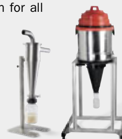
High-performance Cyclone separator and FRITSCH Cyclone separator

The result: a particularly fast and efficient grinding with minimised thermal load at a significantly higher throughput – and particularly easy and fast cleaning.