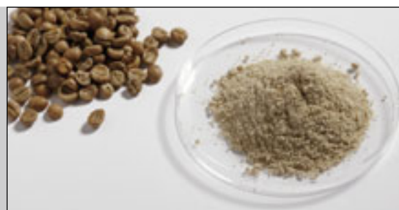
Raw coffee before and after grinding with the P-14 and sieve ring 1 mm trapezoidal perforation at 20,000 rpm

IQ/OQ documentation available to support equipment qualification.