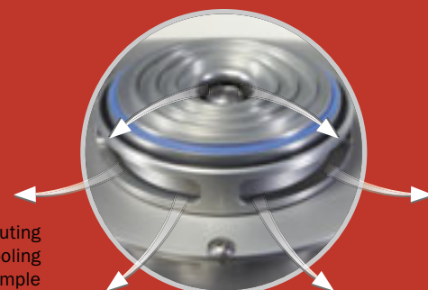
Ingenious air routing for efficient cooling of the sample

Available only from FRITSCH: The ingenious air routing of the PULVERISETTE 14 classic line ensures a constant airflow to cool the rotor, all motor components and the grinding material in the collecting vessel. At the same time, a large fan blows the cooling air into the instrument through a foam particle filter to create positive pressure that prevents the penetration of dirt particles from the ambient air.