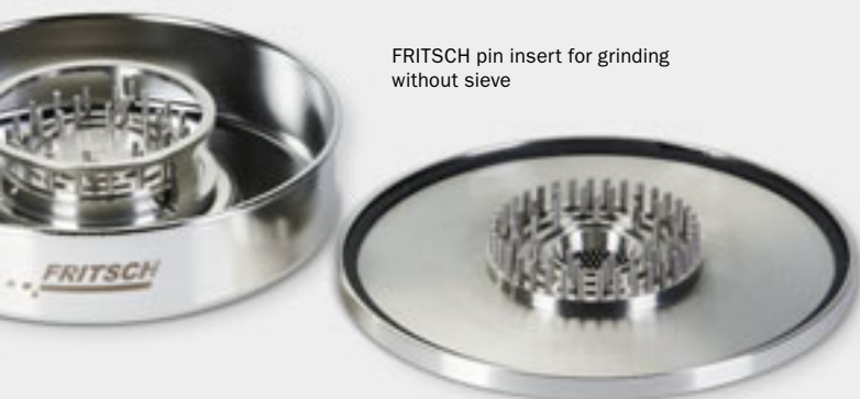
FRITSCH pin insert for grinding without sieve

Another suggestion: During grinding of temperature-sensitive samples, the conversion kit for grinding large quantities with its large nylon support sack ensures a high air throughput, resulting in even better cooling.