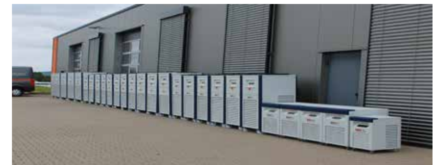
General delivery for Huber USA

Whether special solutions with multiple distribution on the device or temperature control units made of stainless steel with ramp function - we modify our coolers in such a way that they exactly match your application and the conditions on site!