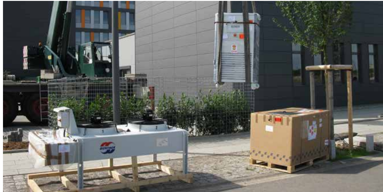
30 kW split system for roof mounting

Many institutes already have their own domestic cooling water supply. This cooling water is generally too cold to cool a laser or an electron microscope, or the water quality is simply too poor.