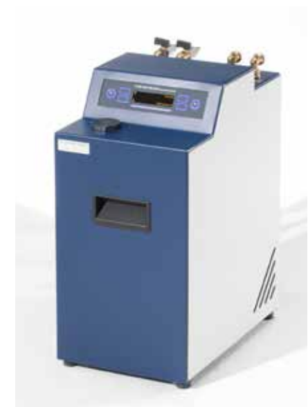
System Separator 9 kW

There are only two more water connections on the back of the unit, which are used to connect to the existing house cooling or water pipes.