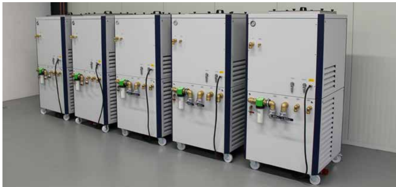
80 kW system separator with filter on the secondary side

These systems can achieve much higher cooling capacities (up to 150 kW) and are much quieter (hardly any vibrations) and have very low operating costs, especially when the cooling capacity increases. The devices are very compact because there is no compressor.