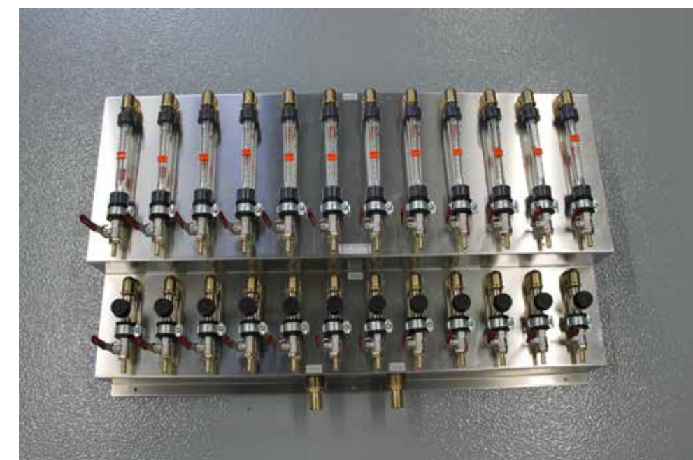
External 12-way distributor to a 50 kW system separator