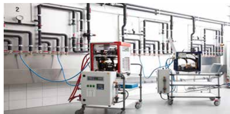
Our test room for system separators and WC-systems