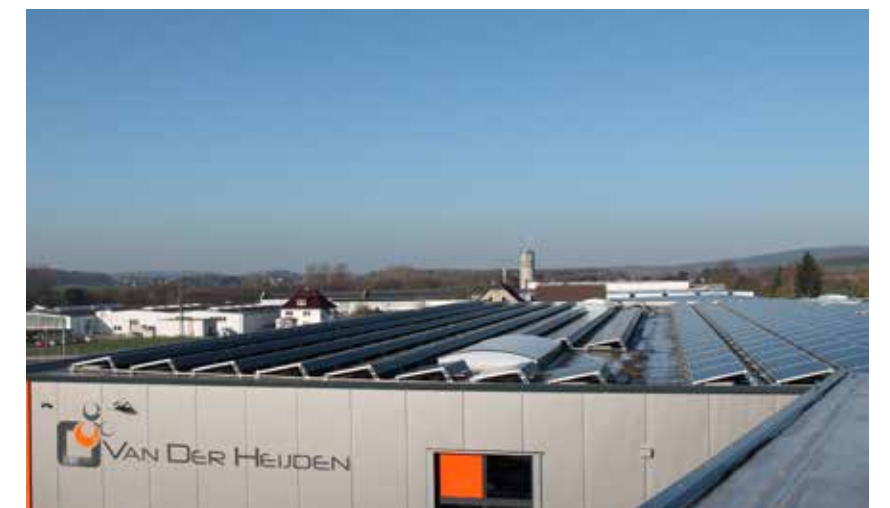
Ecological electricity generation

Our customers want to save water and energy, we develop our laboratory coolers to maximize this and at the same time try to keep prices competitive.