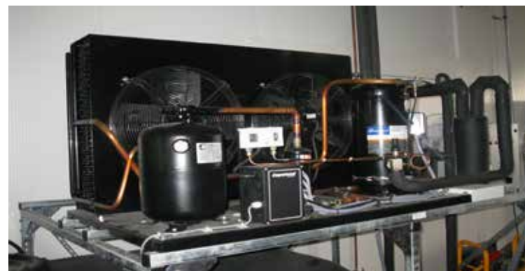
Heat recovery in the test room