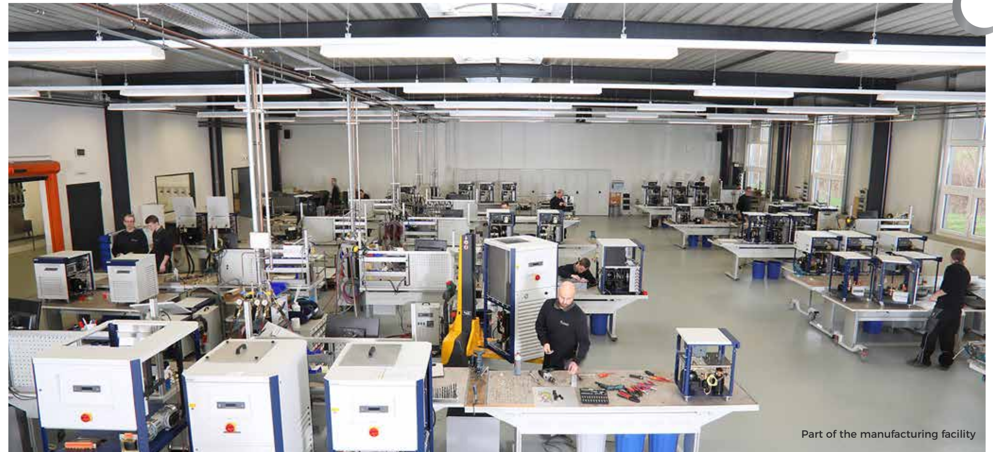
Part of the manufacturing facility

In the end, a higher purchase price pays off due to the long service life and low failure rate.