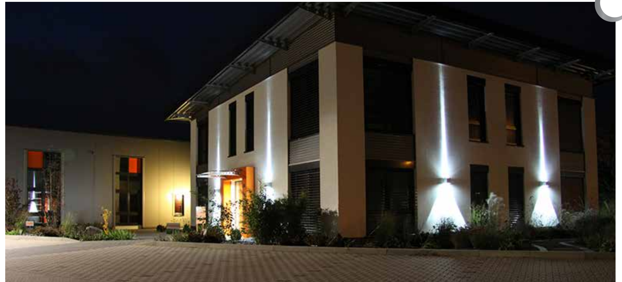
Low energy lamps thanks to the latest LED technology

A Van der Heijden cooler always pays off!