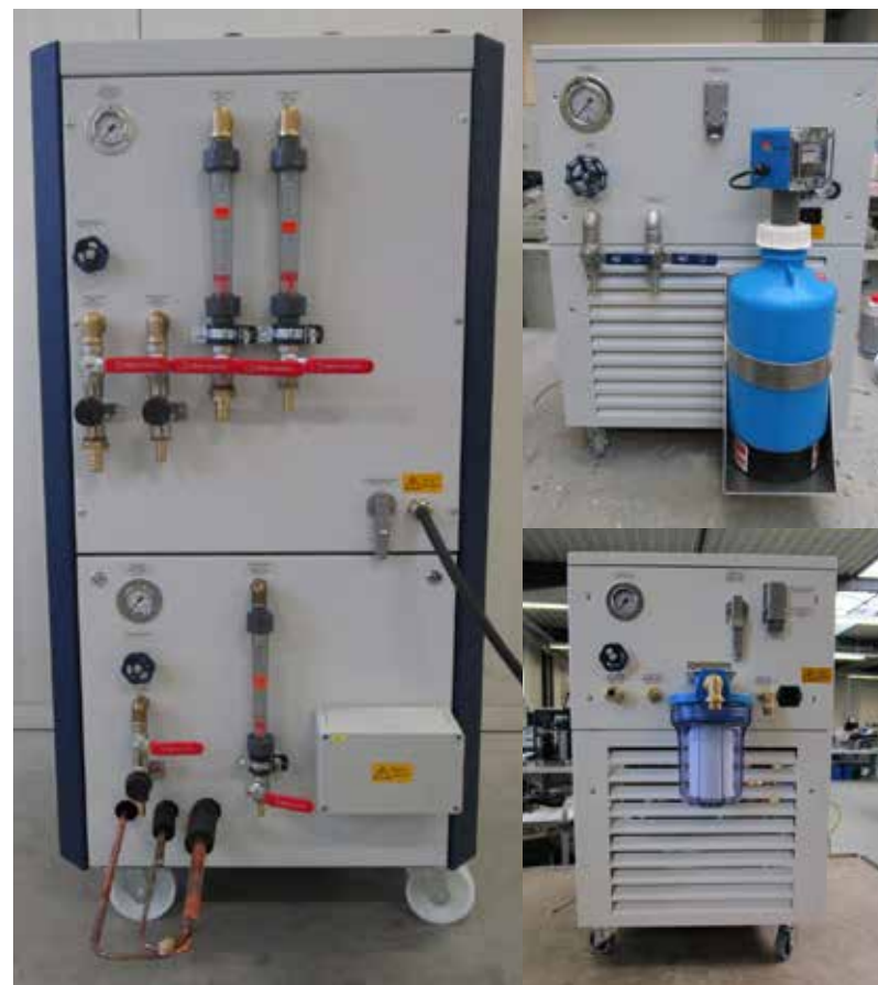
Examples of special construction

Very high quality, powerful, reliable and robust low-cost liquid coolers, made specifically for your application (from a flexible range of options), of high quality at an affordable price.