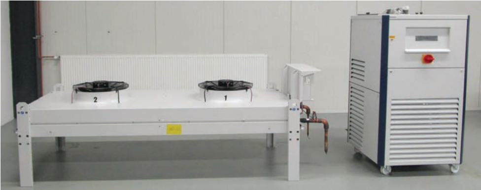
SPLIT VARIANT FOR HIGHER AMBIENT TEMPERATURES