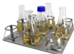
P-9/500 Platform with 9 clamps for 500 ml flasks (360x400 mm)