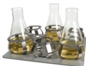
P-6/1000 Platform with 6 clamps for 1000 ml flasks (360x400 mm)