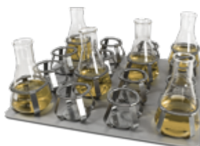
P-16/250 Platform with 16 clamps for 250 ml flasks (360x400 mm)